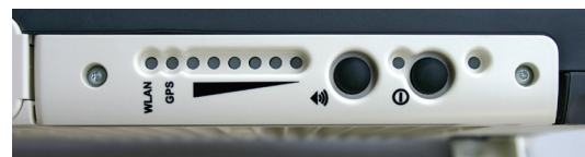
Front view detail

Designed and developed by Hughes, the world leader in broadband satellite networks and services, with more than 2.2 million terminals shipped to customers in over 100 countries.