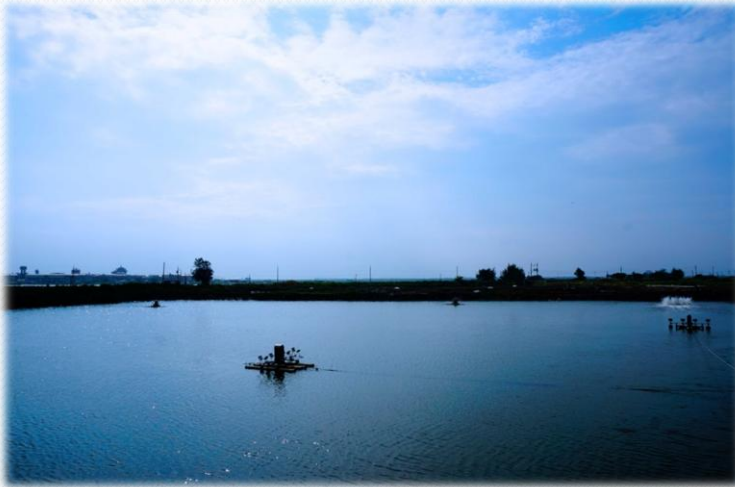
Aqua Farms in Chiayi