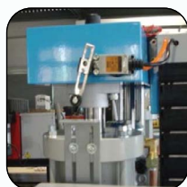
Level Detector 可調式膠桶液位警報