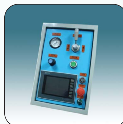
Touch Screen Interface Panel 人機界面控制面板