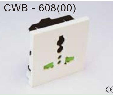
CWB - 608(00)