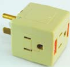
SPB-201SJ (Plug Adaptor)

15A 125V AC 3 Outlet With Surge Thermal Protector