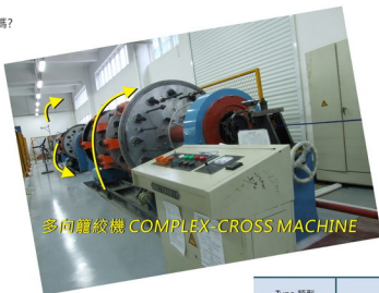
多向纏絞機 COMPLEX-CROSS MACHINE

問: 這樣會造成甚麼問題? Ans: 線轉彎時,內圈會把外圈的線繃死 外圈會提早損壞 線纜旋轉半徑很大