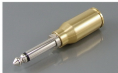
WITHOUT SOLDER CONNECTOR -SUNRISE DESIGN TECHNIC (THIS PRODUCT NOT FOR SALE!!)