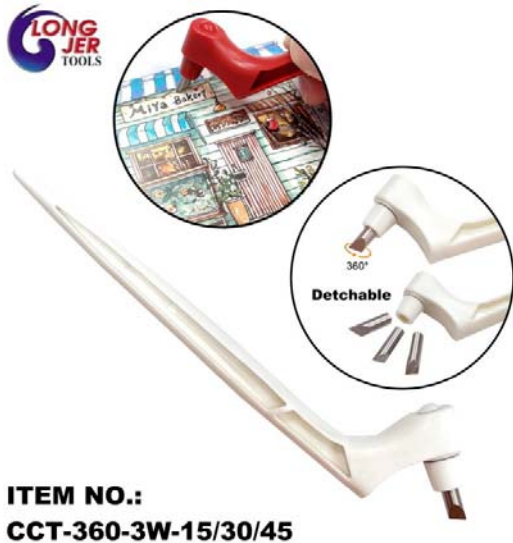
ITEM NO.: CCT-360-3W-15/30/45