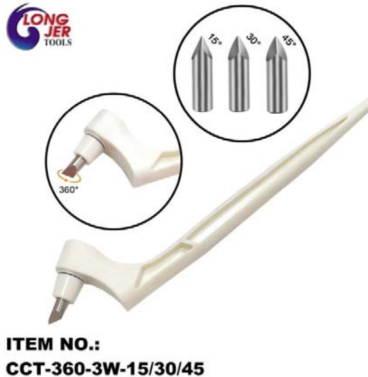
ITEM NO.: CCT-360-3W-15/30/45