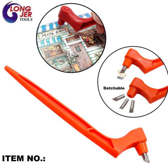
ITEM NO.: CCT-360-30-15/30/45