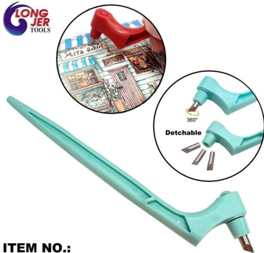
ITEM NO.: CCT-360-3B-15/30/45