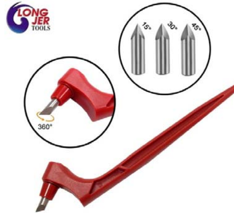
ITEM NO.: CCT-360-3R-15/30/45