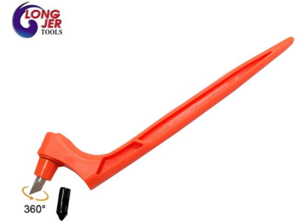
ITEM NO.: CCT-360-30-15/30/45

LONGJER NO: CCT-360-30 (CCT-360-30-15 / CCT-360-30-30 / CCT-360-30-45)