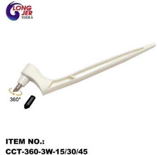
ITEM NO.: CCT-360-3W-15/30/45

LONGJER NO: CCT-360-3W (CCT-360-3W-15 / CCT-360-3W-30 / CCT-360-3W-45)