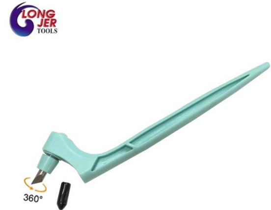
ITEM NO.: CCT-360-3B-15/30/45

LONGJER NO: CCT-360-3B (CCT-360-3B-15 / CCT-360-3B-30 / CCT-360-3B-45)