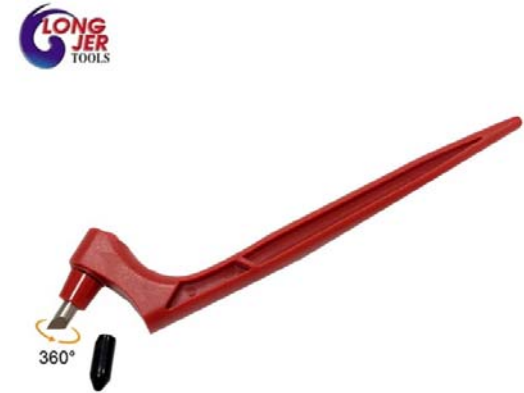
ITEM NO.: CCT-360-3R-15/30/45