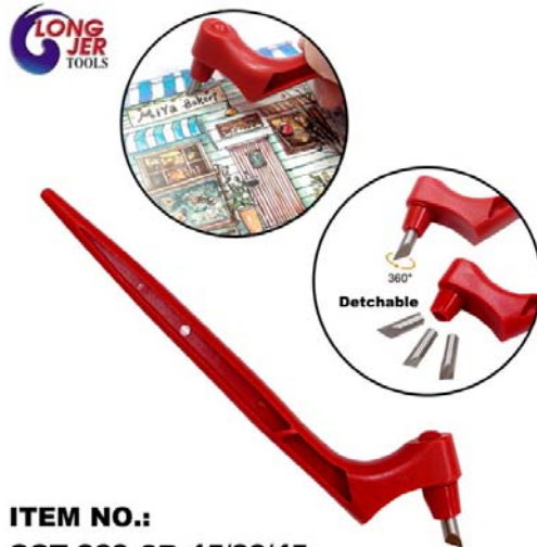
ITEM NO.: CCT-360-3R-15/30/45