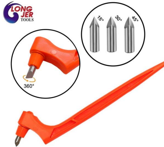
ITEM NO.: CCT-360-30-15/30/45