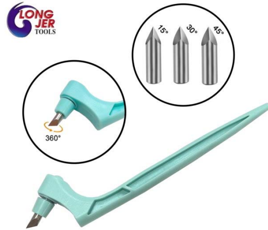
ITEM NO.: CCT-360-3B-15/30/45