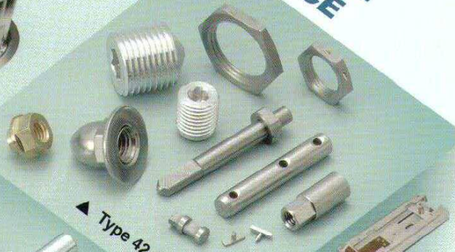
▲ Type 42 CNC Lathe