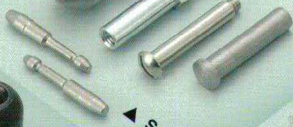
▲ Swiss CNC Lathe