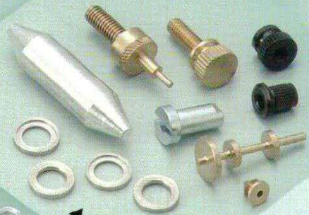
▲ Cam Lathe