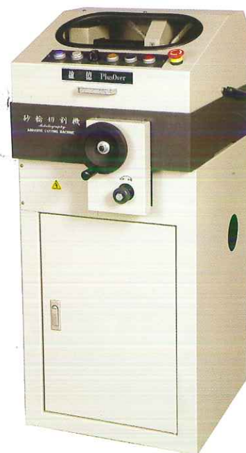
小型切割機 Small Cutting Machine